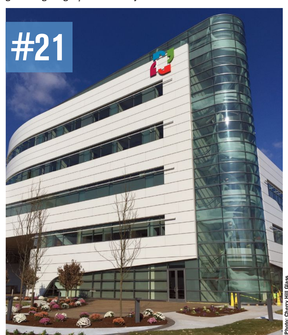
The Hartford Hospital Bone & Joint Institute in Hartford, Conn., sports a multistory glass stairwell, as well as curtainwall, strip windows and more installed by Cherry Hill Glass.