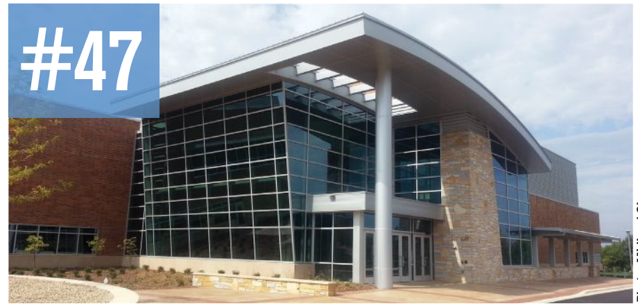
Midland Glass Co. has been the contract glazier on a range of project types, including the Eagle Brook Church in Woodbury, Minn.