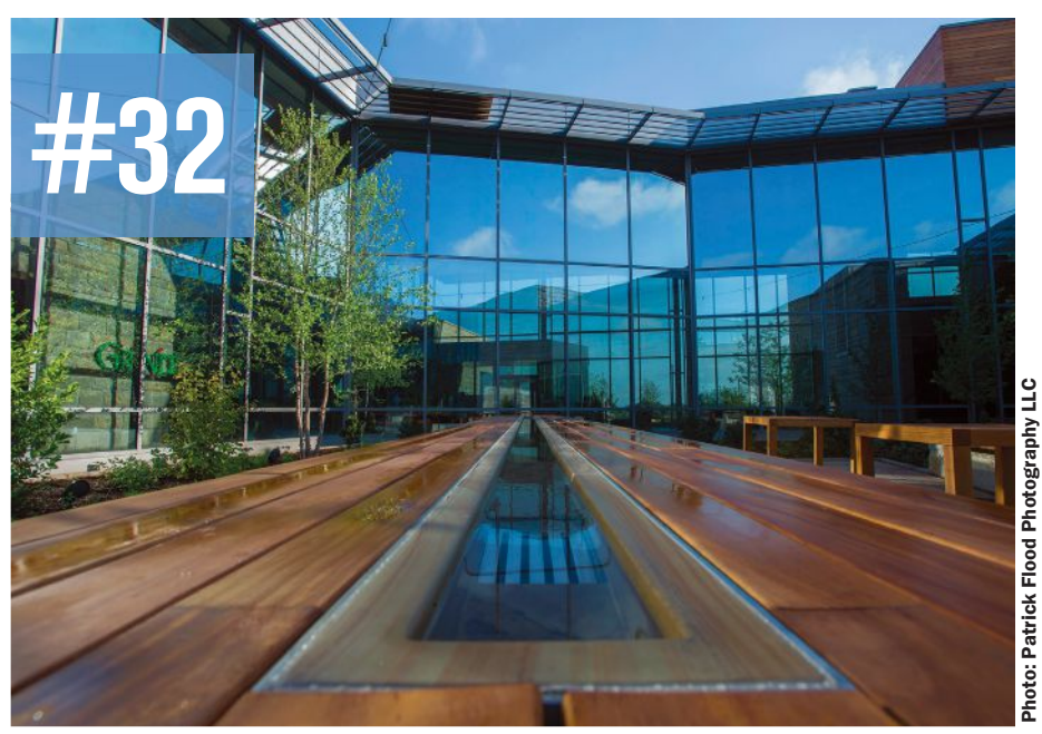
The Grande Cheese headquarters in Fond du Lac, Wis., features an extensive glass and glazing façade installed by H.J. Martin.