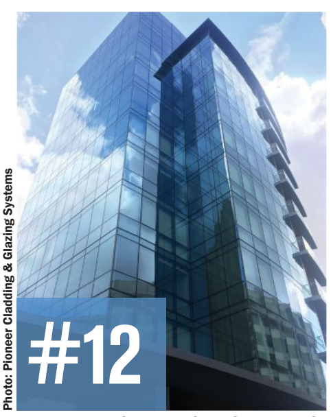
The Dupont Hilton Residential Tower in Washington, D.C., is one project example by Pioneer Cladding & Glazing Systems.