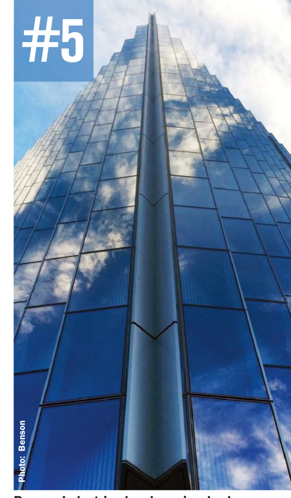
Benson Industries has been involved with many major curtainwall glazing projects, such as the SOM-designed Los Angeles Federal Courthouse in Los Angeles.

When not available, annual commercial sales were estimated.*